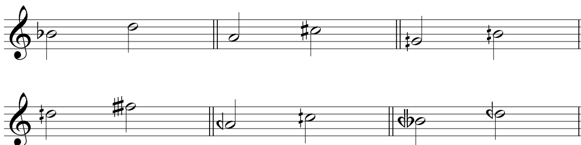
Example 1.11: Six different major thirds

major third. All of the intervals in Example 1.11 are major thirds (int 4.0); the first two are spelled with conventional pitches while the following four use the less-familiar quarter-tone accidentals. 15