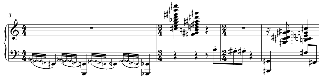
Example 1.10: Ives, Allegro , mm. 3-6 transcribed

pitches are distributed between the staves. Example 1.9b is easier to see as a melody, although the use of ancillary arrows privileges the conventional pitches by making the quarter tones look like mere modifications of their conventional counterparts. The shaped notes of Example 1.9c, with square noteheads signifying raised pitches, are hard to read because it is difficult to distinguish between the round and square noteheads. Example 1.9d, which is notated in Carrillo's system, using integers ranging from 0 to 23 to represent the full gamut of quarter-tone pitch classes, gives an idea of how difficult it is to read even a simple melody when notes on the familiar 5-line staff are replaced with pitch-class integers. Even though it takes some time to become familiar with the new accidental signs, I believe that Example 1.9e is the best of the five versions given in Example 1.9. In Example 1.9e, I have written the melody using the accidentals that I use throughout this dissertation. 13