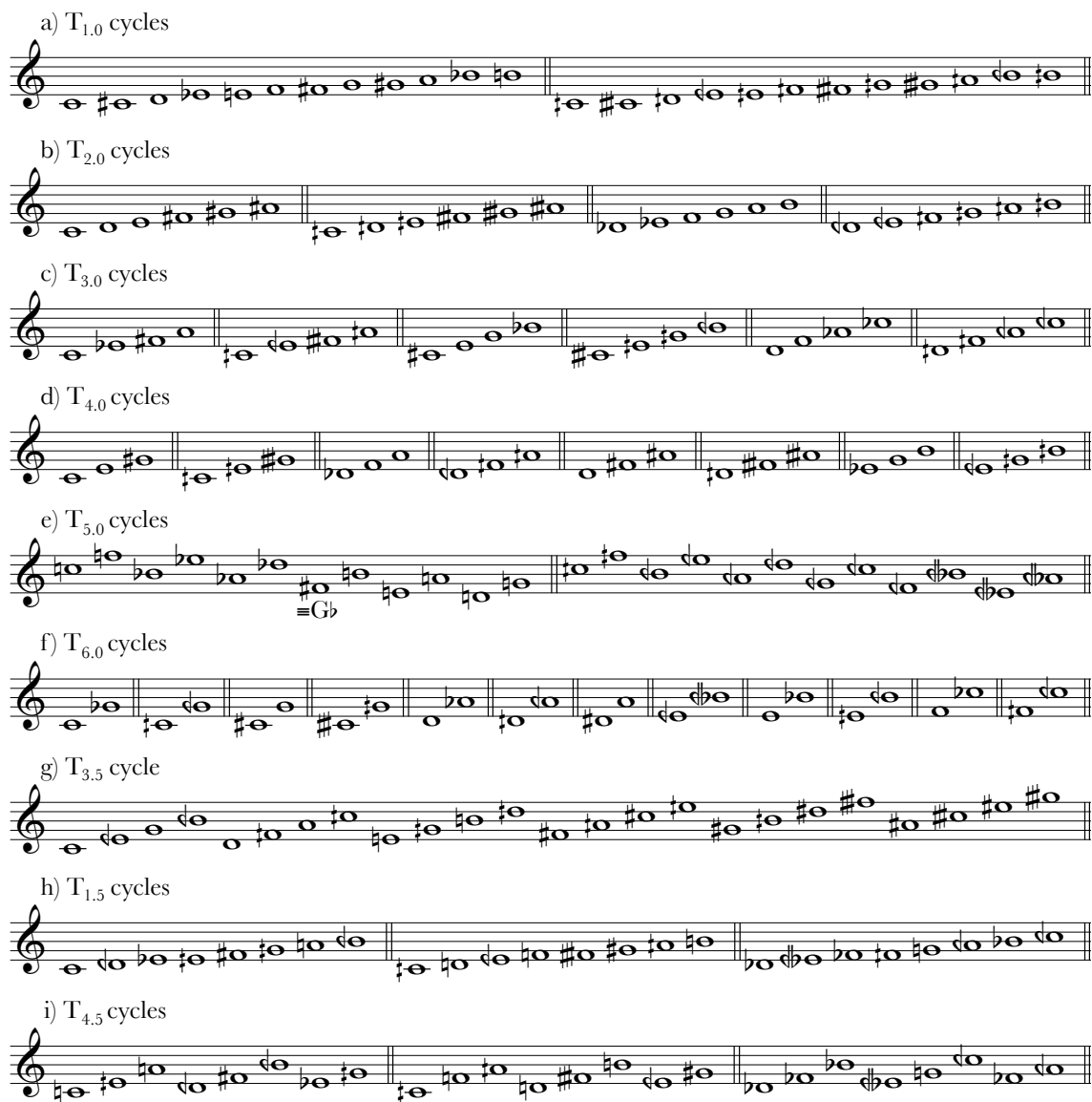
Example 1.19: Interval cycles

transpositions by int 2.5. I indicate the transposition up by int 2.5 with the symbol “ T_{2.5} ” and the transposition down by int 2.5 either by “ T_{9.5} ” (which assumes octave equivalence), or by “ T_{-2.5} ” (the negative sign indicates a transposition downward).