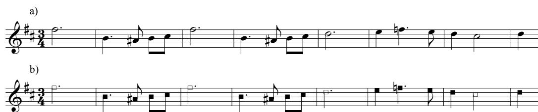
Example 1.4: Excerpt from Schubert, Symphony No. 8 : a) conventional noteheads; b) square-shaped noteheads

Some composers use conventional notation, but then add small signs to indicate quarter-tone inflections. In the opening section of the first movement of Ernest Bloch's Quintet for Piano and Strings (Example 1.2), the small slash indicates that the following pitch, in this case C \sharp , should be raised one quarter tone. A different convention appears in Bartók's Sonata for Solo Violin (Example 1.3), where he uses a small upward-pointing arrow to raise pitches by one quarter tone. In general, ancillary signs such as these are typically used by composers who are using quarter tones as auxiliary microtones that embellish an otherwise conventionally-tuned texture.